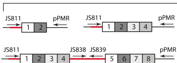
Primer positions in pDGE1-4